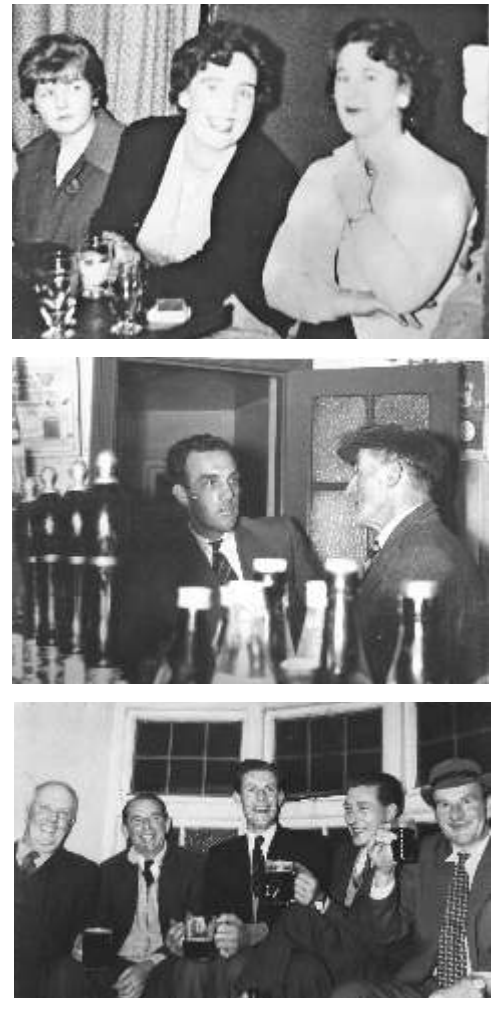
At that time the local fox hunt used to use the pub as a gathering point - the beagles were corralled into the garden while the huntsmen had a drink.