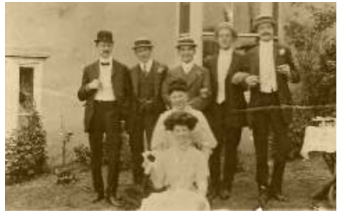
Our first glimpse of it is of a wedding reception from 1912. The subsequent reception was held in the pub garden.

For most of its life, however, it was called The Fullers Arms Hotel, and it is only since the 1970s that it has been called The Berwick Inn.