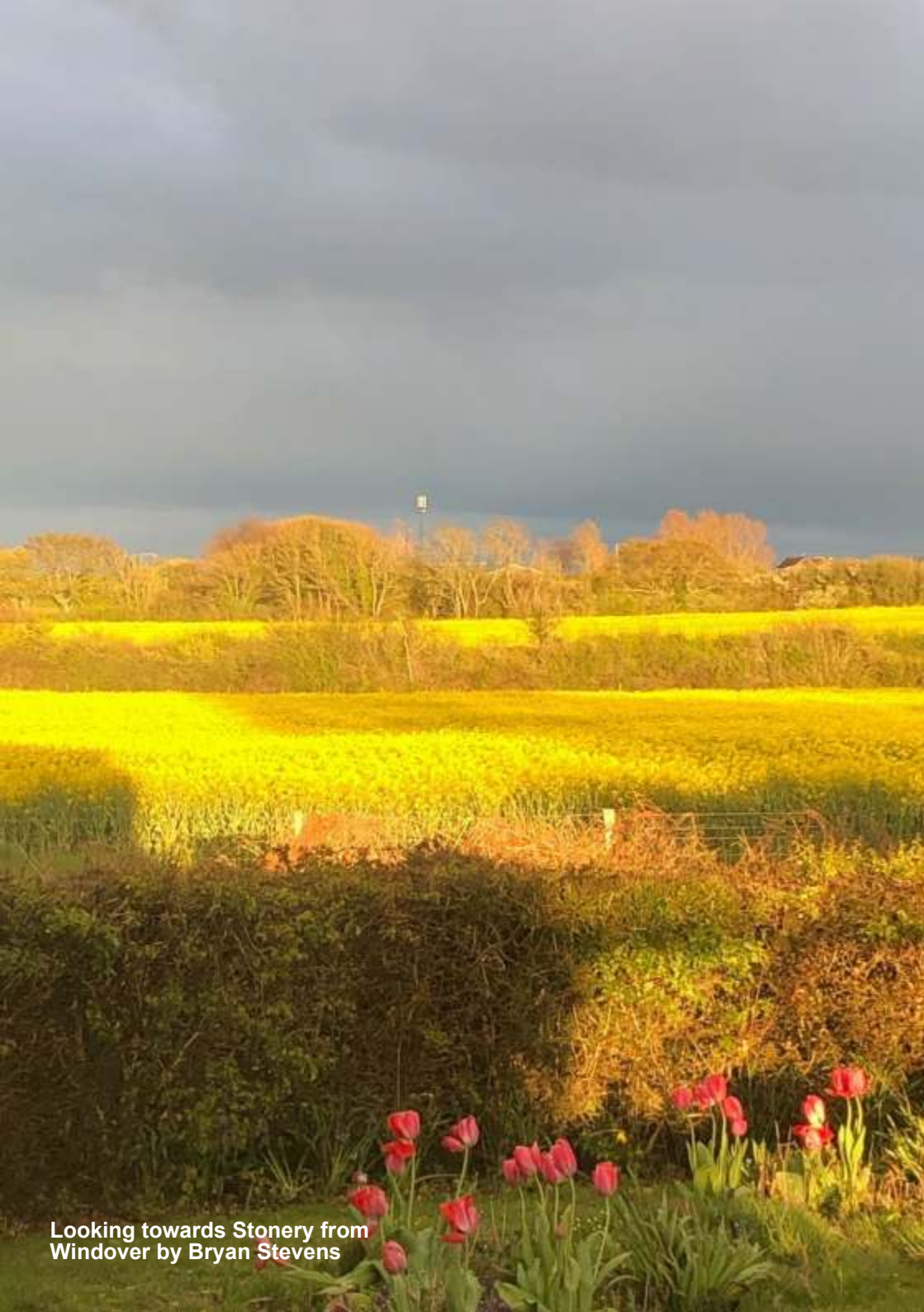
Looking towards Stonery from Windover