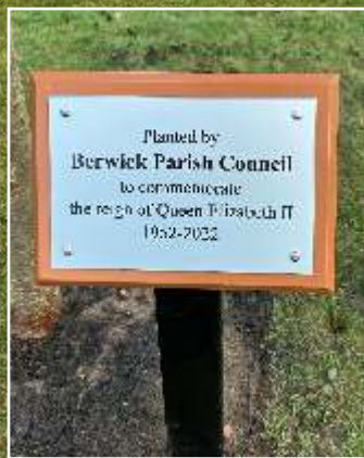
Commemorative tree planted on Berwick playing field on 27 th March.