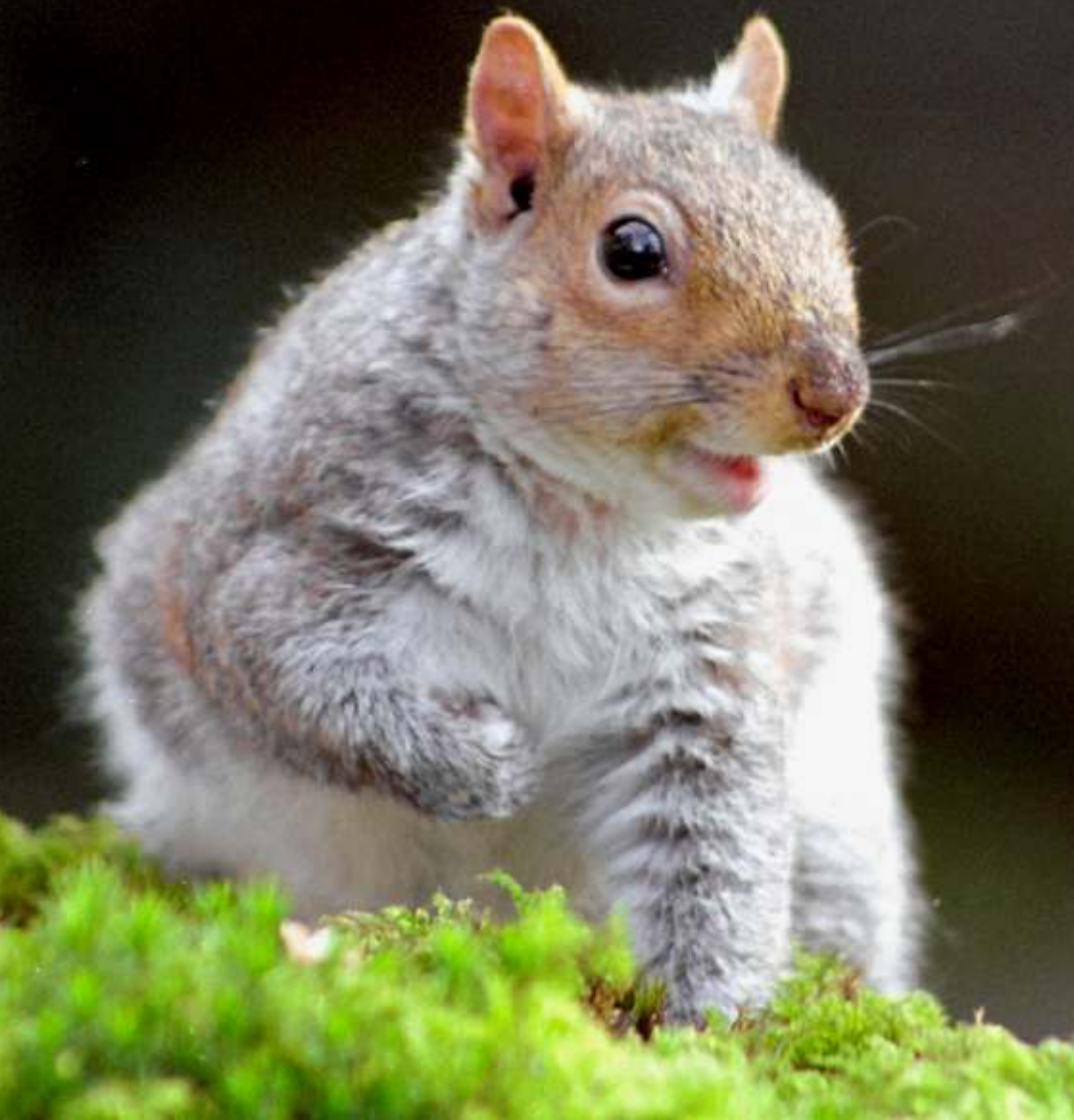
Grey Squirrel