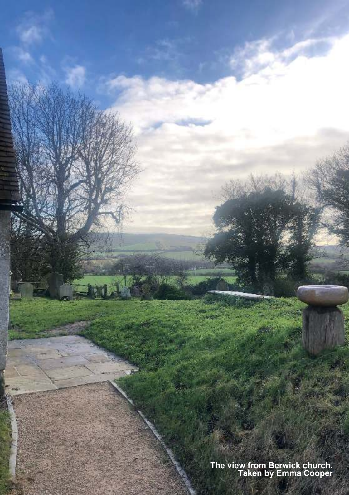
The view from Berwick church.